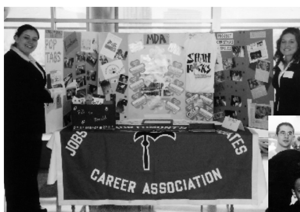
JOG Students at Center of Science and Industry

An added highlight to the day for many of the students was a visit to the Center of Science and Industry. At the end of the day, all were treated to hearing the award winning speech.